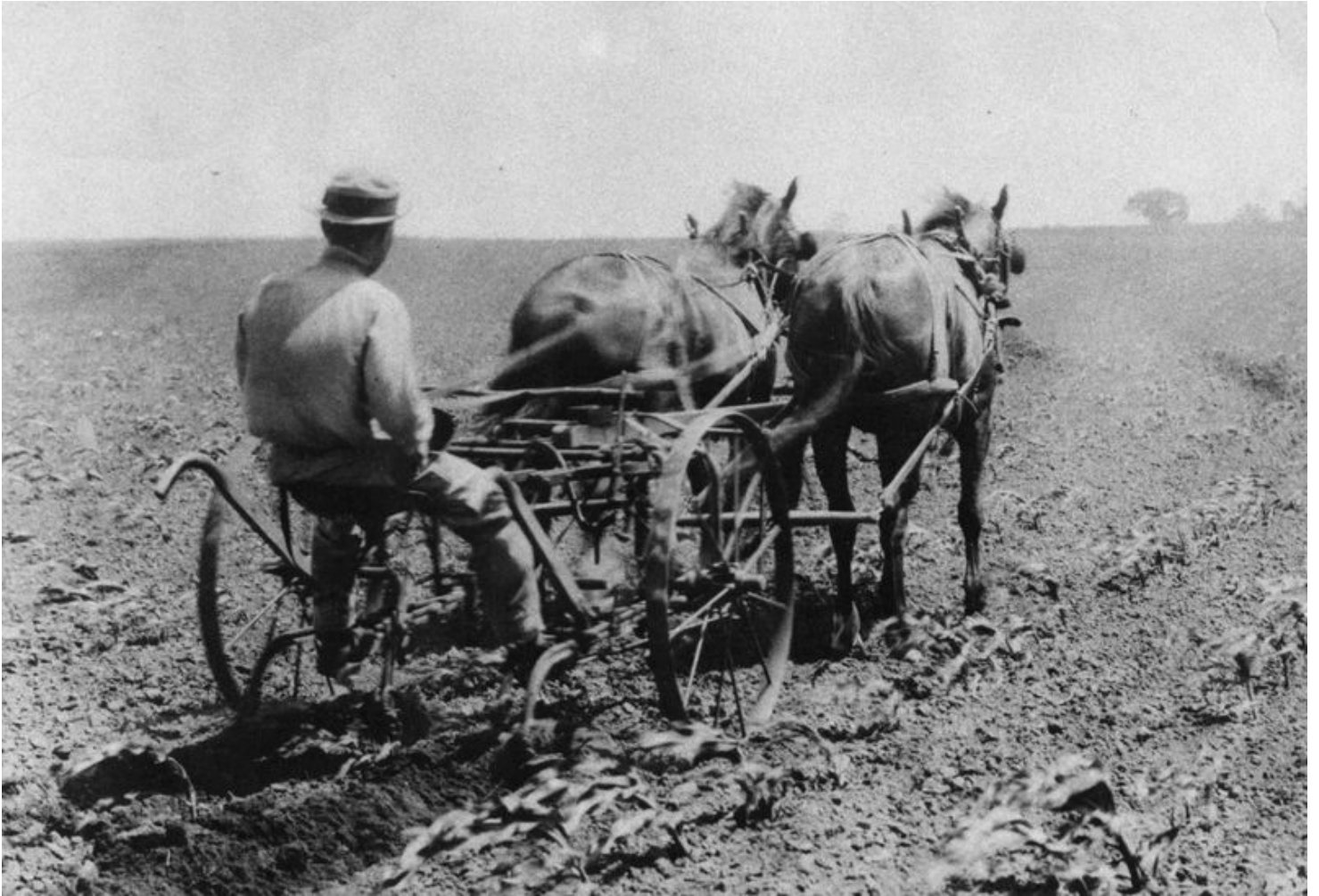
Farming years, 1910