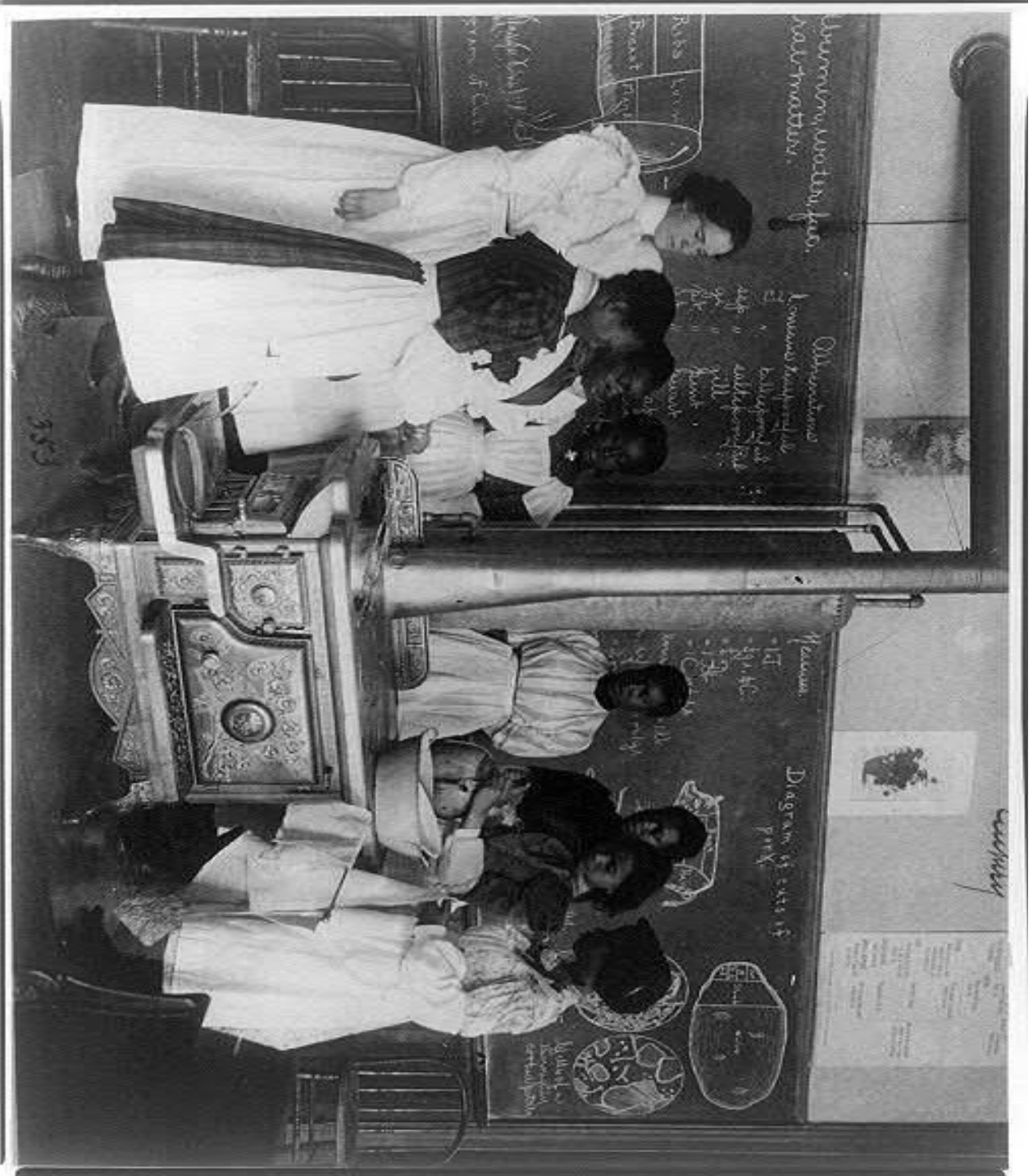
Girls learning to use a stove. ca 1899