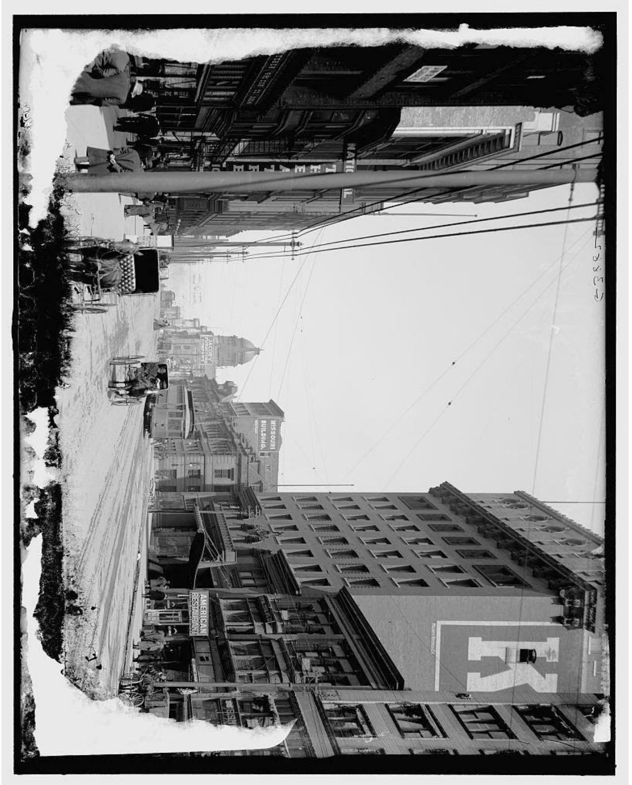
Grand Avenue, Kansas City, MO. ca 1900