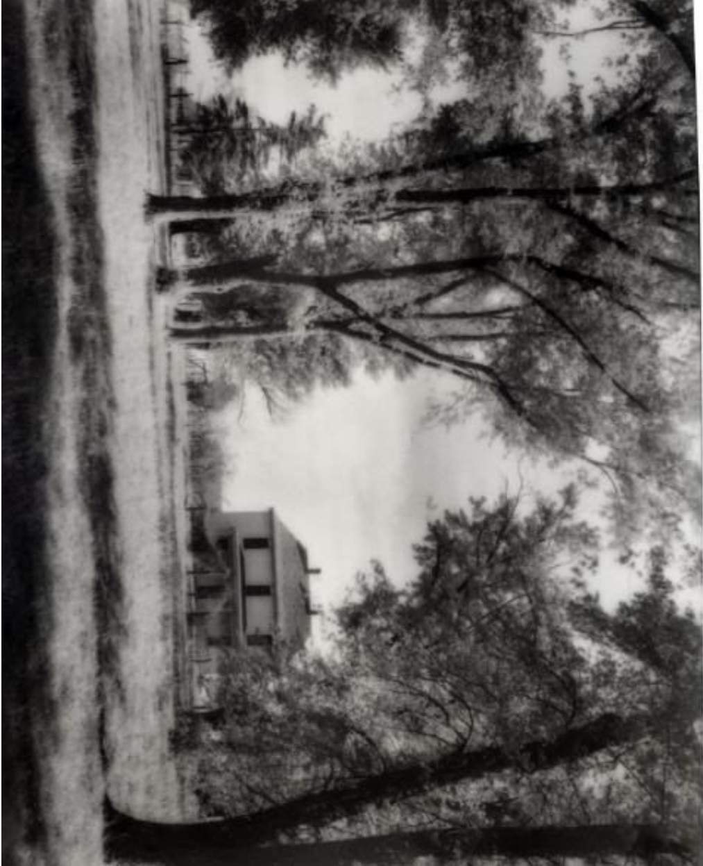
The Truman Family Farmhouse, Grandview, MO. ca 1905