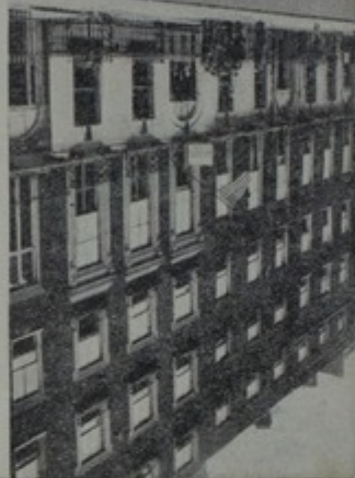
Left: VICTORY CLUB 18, Seymour Street, W.1. 'phone Welbeck 5491 Bus Service Nos: 2, 6, 7, 8, 12, 13, 16, 17, 30, 36, 66, 73, 74, 88, 137. Alight at Marble Arch.