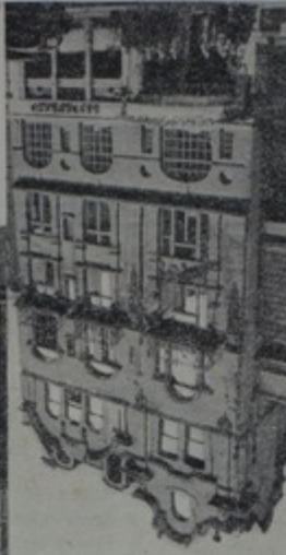
Right: WASHINGTON CLUB 'phone Cranmer 4901 'phone Curzon Street, W.1. Bus Service Nos: 9, 14, 19, 22, 25c, 25c, 38, 38a, 96. Alight at Berkeley Street, Piccadilly.