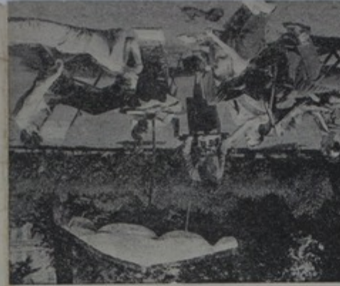
Below: PRINCES GARDENS CLUB FOR OFFICERS 16, Princes Gardens, S.W.7. 'phone Kensington 7212 Bus Service Nos: 9, 49, 52, 73. Alight at Exhibition Road.