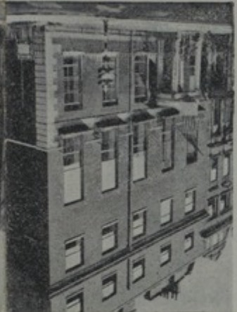
Below: AMERICAN RED CROSS CLUB 10, Charles Street, W.1. 'phone Grosvenor 2261 Bus Service Nos: 2, 13, 14, 113, 1 Fortman Street South Kensington Bus Service Nos: 6, 7, 8, 17, 60, 73, 88, 137 Alight at Selfridges, Street.