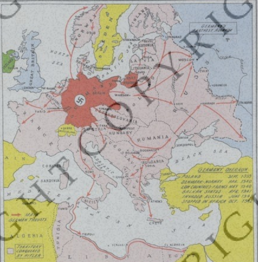
AFTER VERSAILLES 1918 AND HIGH TIDE OF HITLER'S EMPIRE ~ 1942

TANK DESTROYER FORCES ATTACHED TO GROUND FORCE DIVISIONS