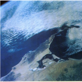
Punta Eugenia area of Baja California, Mexico, looking toward the west. Body of water at right center is Bahía de Sebastián Vizcaino. Pacific Ocean covers upper half of picture. Isla de Cedros is at upper right. This photograph was taken on August 21, 1965, during the fourth revolution of the Gemini V spacecraft.