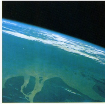
Mouth of Yangtze River, coast of China (Kiangsu and Chekiang provinces), looking to the east. City of Shanghai is located at junction of river and canal, just to left of clouds in lower center of picture. The alluvial silts are clearly visible, being carried out into the East China Sea from the Yangtze (left) and from the Hangchow Wan River (right) for a distance of up to 75 miles. This photograph was taken August 23, 1965, on the 23rd revolution of the Gemini V spacecraft.