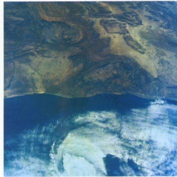
Coast of Morocco, showing a small offshore cyclonic weather disturbance. The counterclockwise air rotation of the cyclone is clearly visible. The cyclone is located over the North Atlantic Ocean, about 60 miles west of the shoreline. The Spanish Colony of Ifni is situated along the coast near the center of the picture. This photograph was taken at an altitude of 125 miles on August 25, 1965, during the 74th revolution of the Gemini V spacecraft.